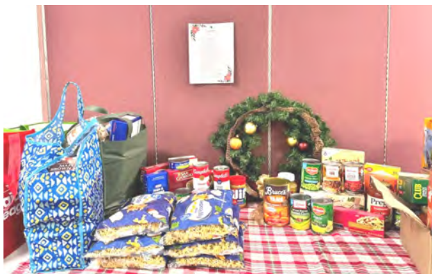
Pictured above: Just a small amount of all the items donated for the food pantry during the Advent month of December.